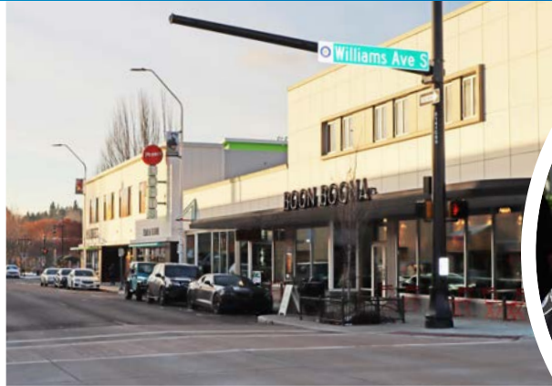
Downtown earned Main Street designation